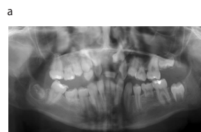
Figure 4. Rieger syndrome: 13 year old girl with agenesia of 12 permanent teeth and a hypertrophic maxillary frenulum (a). Infraoccluding deciduous molars, few occlusal contacts, impacted left maxillary canine (b).

Examples of cases presented to the students. After the consultation, the students were asked to prepare a presentation comprising a clinical case description including facts on the particular syndrome, medical and oral implications, and treatment suggestions.