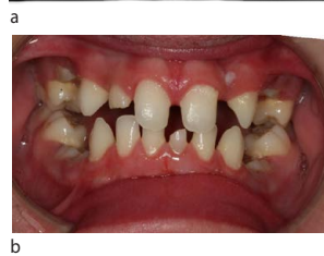
Figure 2. Williams syndrome: 13 year old boy with congenital agenesis of 11 permanent teeth, infraoccluding deciduous molars, bilateral open bite in the lateral segments, and mesial tipping of all permanent molars (a). Narrow permanent incisors (b).

Examples of cases presented to the students. After the consultation, the students were asked to prepare a presentation comprising a clinical case description including facts on the particular syndrome, medical and oral implications, and treatment suggestions.