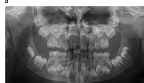
Figure 3. Cleidocranial dysplasia: 8 year old boy with retained deciduous teeth, hypomineralized and hypoplastic enamel (a). Non-erupted permanent teeth and supernumerary permanent teeth in the anterior maxillary region (b).

Examples of cases presented to the students. After the consultation, the students were asked to prepare a presentation comprising a clinical case description including facts on the particular syndrome, medical and oral implications, and treatment suggestions.