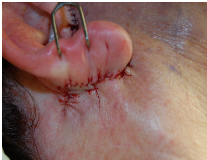
Figure 2. Completion of the closure of the postauricular extension of the incision which permits improved trimming and draping of the cervicofacial flap as well as in-setting

In summary, two easy to perform modifications are described for the original MACS lift which can improve the aesthetic outcome and durability without additional risk of complications above the known baseline [2].