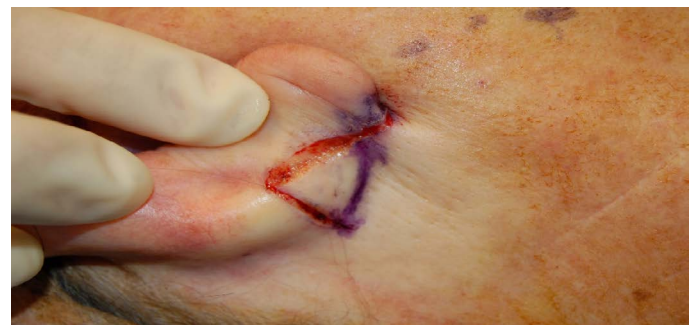
Figure 1. Right postauricular incision which extends onto the postauricular surface of the pinna (concha bowl) with the superior horizontal limb of the incision extending to the postauricular sulcus. The postauricular sulcus is marked in blue

The second modification is placement of an additional purse string suture (parotid region) inside the first purse string suture. The first purse string suture placed covers a larger area than typically described for the MACS-lift. This second purse string suture completely flattens