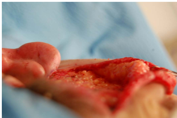
Figure 6. Surface view of the parotid region showing complete smooth flattening of the region eliminating the soft tissue dome contour required deformity. Patient's left side