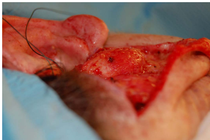
Figure 5. Surface view of the soft tissue dome created by the purse string suture over the parotid region. Patient's left side