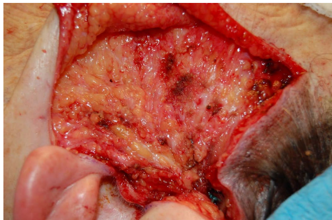
Figure 4. Bird's-eye view of the soft tissue dome following placement of the second purse string suture inside the first purse string suture. Complete flattening of the soft tissue dome seen with additional vertical lift and tightening of the region potentially providing an improved aesthetic outcome and durability. Patient's left side