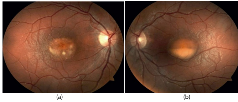
Figure 1. Ophthalmoscopy of the right eye (a) revealed a big yellow macular lesion surrounded by few smaller lesions with clear content and moderate retinal edema in the central part of the retina (similar to BVD “scrambled egg” stage). In the left eye (b) we found a big round lesion with liquid line in the central part of the retina (similar to BVD pseudohypopyon stage).