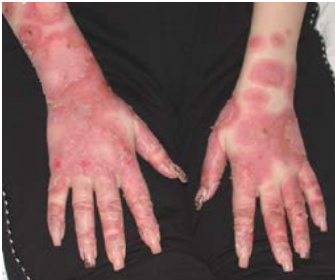
Figure 1. First episode. Annular, targetoid, polycyclic erythematous and scaly plaques in acral regions.

A skin biopsy showed mild superficial lymphocytic perivascular infiltrate with few eosinophils, vacuolar alterations of the basal cells, and individual necrotic keratinocytes (Figure 2). Hydroxychloroquine was discontinued and the dose of prednisone was increased to 60 mg/day. Full remission of the lesions occurred after 2-3 weeks,