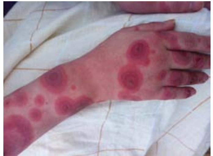
Figure 3. Second episode. Raised erythematous areas and targetoid lesions typical for erythema multiforme.