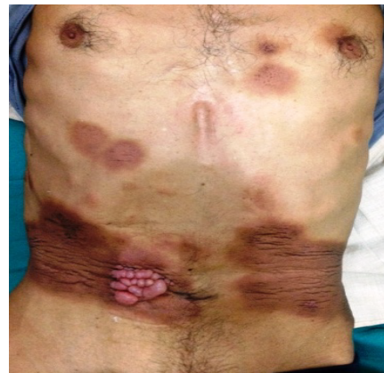
Figure 1. Clinical photograph showing patches of brownish discoloration and periumbilical skin nodules.

Tumors spreading through hematogenous route (kidney, lung)