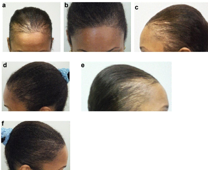
Figure 2. 1652 grafts; 9 months post op.