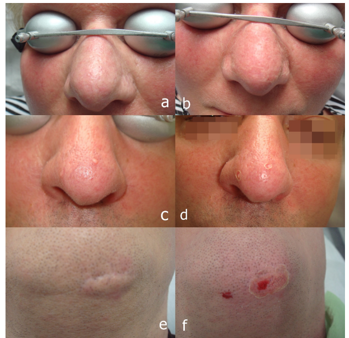
Figure 2. Erbium-YAG laser treatment of facial lesions. Sebaceous gland hyperplasia (a) before and (b) immediately after laser. Fibrous papules of the nose (c) before and (d) immediately after laser. Hypertrophic scar (e) before and (f) after laser treatment.

excellent esthetic outcome (n=10). We have seen no scarring or pigment changes at all.