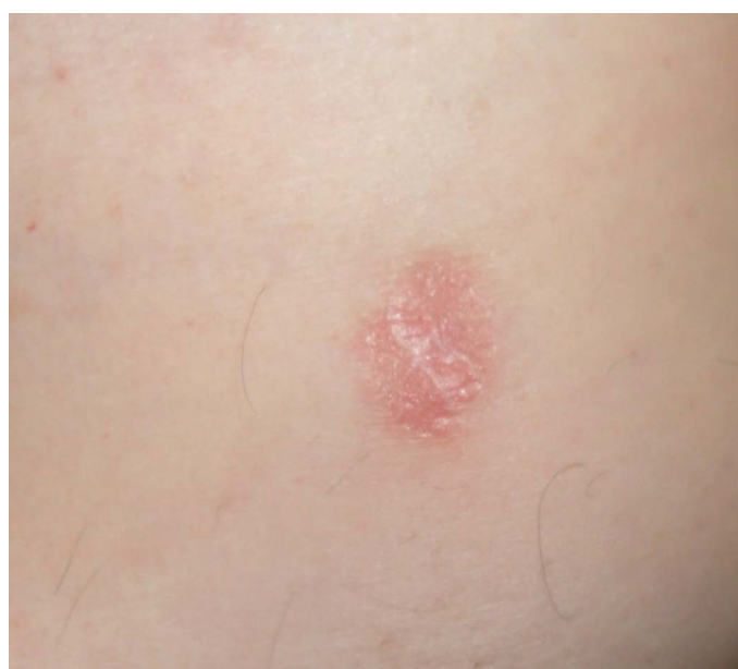
Figure 1. Solitary well defined scaly plaque on the inner arm.

Histopathologic findings as originally described by Walsh et al. [1] resemble that seen in psoriasis and includes regular or sometimes irregular acanthosis, with focal to confluent mounds of parakeratosis intercalated with collection of neutrophils throughout the cornified