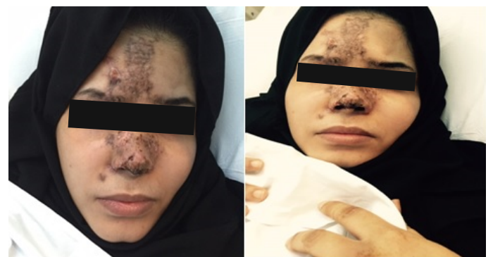
Figure 1. Complete right sided blindness with healing skin lesions (at 3 weeks).

Based on the world-wide literature, it has been suggested to bear in mind the following golden rules to avoid/minimize the chances of inadvertent intravascular injection of the filler agent and subsequent serious effects [1]. Firstly, aspiration each time before injection which is the most important maneuver. Secondly as regards to the injected material, taking more care in cases of fat injections versus not-fat substances (fat as a filler has highest risk) and the use of vasoconstrictor with each procedure in appropriate doses. The other important domain is the nature of the needles used, it is advisable to use blunt and smaller gauge needles to avoid vessel penetration. The volume injected has to be more than 0.5cc per pass with use of gentle force at each injection.