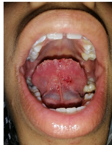
Figure 2. Clinical photos of the tongue showing multiple vesicles with translucent and yellowish contents, sometimes