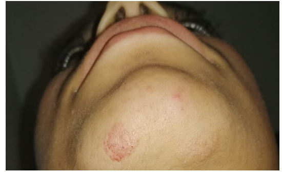
Figure 5. On chin, a small plates of 1 cm surmounted by small clear vesicles