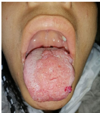
Figure 1. On the tip and ventral surface of the tongue, there are some vesicles of the same characteristics, without lesions on the floor

There exist multiple therapeutic options, starting with therapeutic abstention in small lesions, surgery, sclerotherapy and electrocoagulation, the CO2 laser (Figures 1-5).