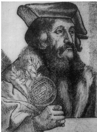
Figure 1. Girolamo Fracastoro (1478-1553).

From this century, we can also mention Gabriele Falloppio (1523-1562) who wrote the " Libelli duo, alter de ulceribus, alter de tumoribus