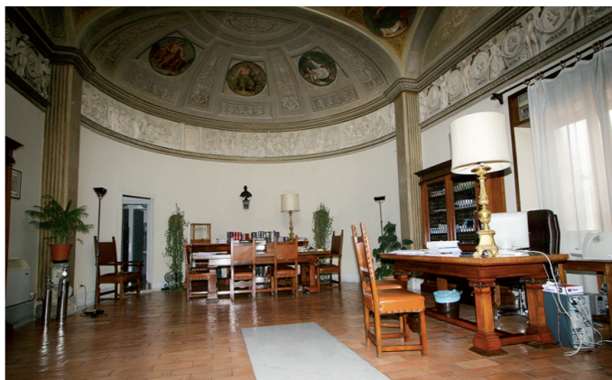
Figure 2. San Gallicano Hospital.

San Gallicano (Figure 2), which was founded in 1725, was the first hospital in Europe specific to the treatment of skin diseases. Although the hospital Saint Louis in France had been founded before San Gallicano in 1607, it became a dermatological hospital much later, in 1801. Most patients suffering from contagious, pruritic, and venereal diseases whom had not been accepted by other hospitals were referred