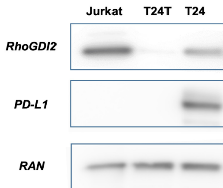
Figure 1. Western blots comparing T24 and T24T bladder cancer cell lines. The more aggressive and tumorigenic T24T shows a loss of PD-L1 expression. Jurkat cells serve as a negative control for PD-L1. RAN is a nuclear protein that serves as a loading control for all lanes

hypothesis is that tumors that are highly mutated are more likely to generate neoantigens which make them more susceptible to activated immune cells. Through the development of next generation sequencing (NGS) technologies including whole genome sequencing (WGS) and RNAseq examining the mutational profile of tumors has become much easier. Analyzing the genetic signatures of tumors might identify patients who have higher chances to respond to checkpoint inhibition. Multiple studies have shown that a high tumor mutational burden (TMB) of greater than 100 non-synonymous single-nucleotide variants (nsSNV) per exome correlates with greater efficacy of diverse anti PD-L1/PD-1 drugs [30].