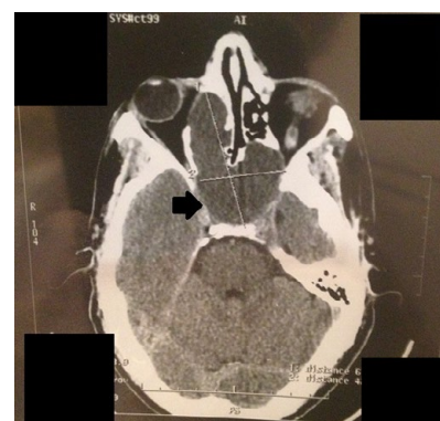
Figure 1. Axial CT revealed a large mass in sphenoid sinus with extension into the right ethmoidal with marked thinning of the internal wall of the orbit.

Introduction: In 1872, Rouge identified the first case of sphenoid sinus mucocele and later described by Berg in 1889 [2]. Mucoceles are benign lesions, expansile and locally destructive, causing erosions of the bony walls of the sinus [3]. Approximately two-thirds of all mucoceles are commonly found in the frontal sinuses, and the majority of the remainder involves the ethmoidal sinus [4,5]. The aetiology of sphenoid sinus mucocele is still unknown. Proposed theories for development of mucocele include cystic dilatation of the glandular structures and cystic development of embryonic epithelial residues [6,7]. Furthermore, Trauma and chronic inflammation (polypoid sinusitis) are considered to be causes of mucocele formation [8,9]. In the literature, some authors