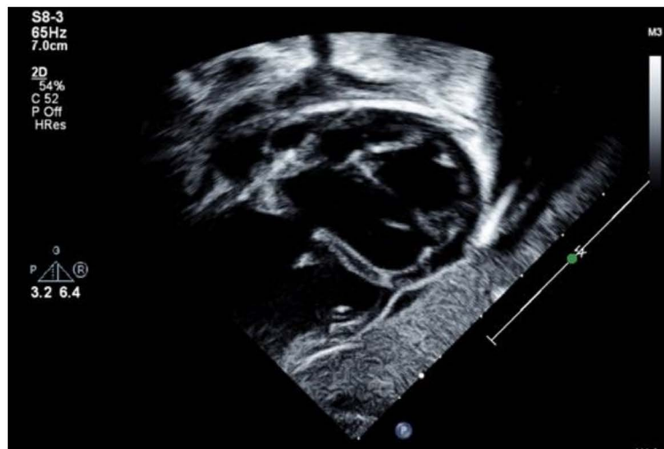
Figure 2. Subxiphoid sagittal image at end-systole demonstrating 5 mm high muscular ventricular septal defect and severe biventricular enlargement. Measured ejection fraction 29%.