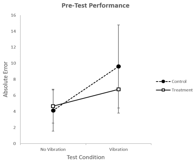
Figure 2A. Training Group (Control/Treatment) by Time (Pre-Test/Post-Test) Interaction Effect. Pre-Test mean absolute error of the left arm for both No Vibration and Vibration test conditions for both the Control (solid circles) and Treatment (open squares) groups. Error bars represent standard deviation.