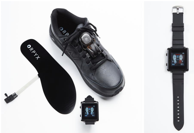
Figure 1. The SurroSense Rx® Smart Insole System

Specifically, a simulated decision tree economic model was built to explore the short- (Figure 2) and long-term (Figure 3) cost effectiveness of the adjunctive use of the SurroSense Rx® device in comparison to alone, in the prevention of DFUs with recent history of the same. Device efficacy was estimated using the results of a pilot cohort study that was conducted on patients of the defined demographic. In our analysis, SOC was defined using best practice strategies for the management of patients with a history of diabetic foot disease [21,22].